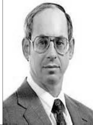
Krashen, S. (1982). Principles and Practice in Second Language Acquisition . Oxford: Pergamon Institute of English.

Wow... she sure is using a lot of Spanish... she NEVER speaks in English anymore.