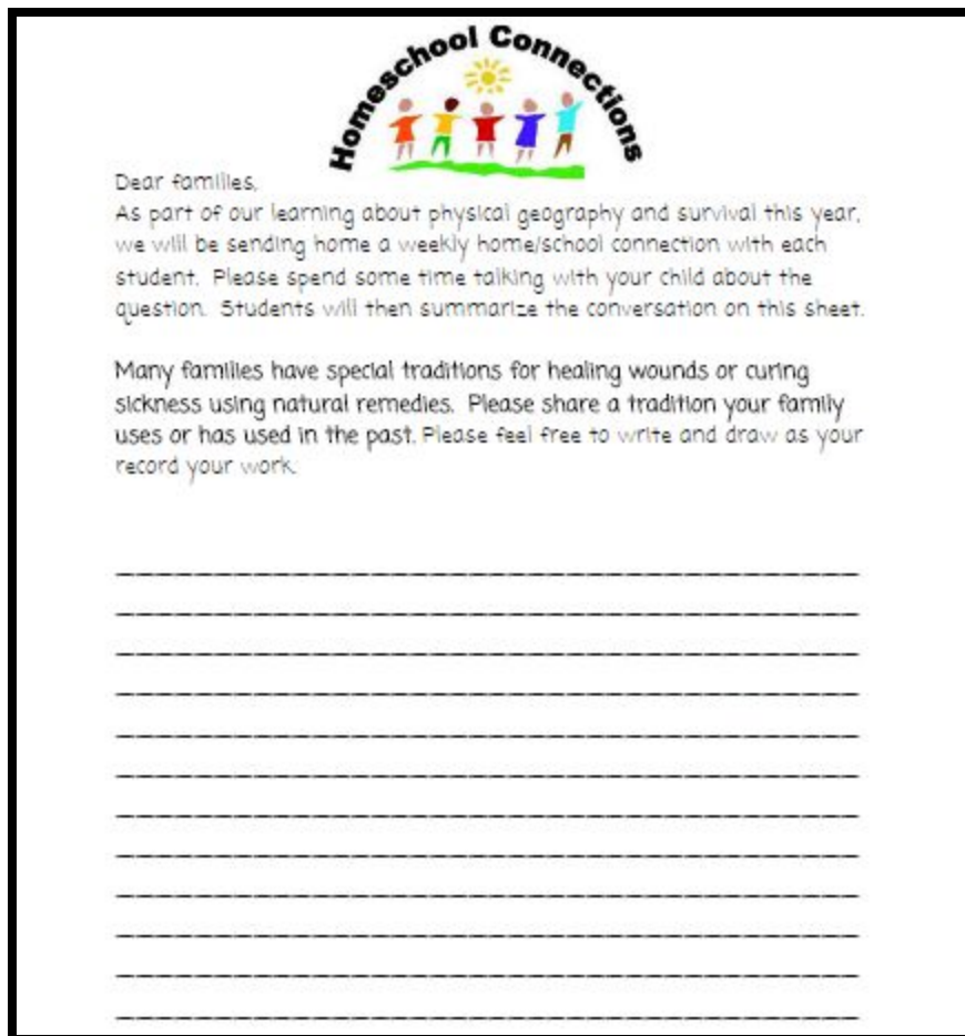
Home School Connection: homework that emphasizes a conversation with family, inquiry and supports diverse responses.