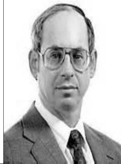
Krashen, S. (1982). Principles and Practice in Second Language Acquisition . Oxford: Pergamon Institute of English.

Wow... she sure is using a lot of Spanish... she NEVER speaks in English anymore.