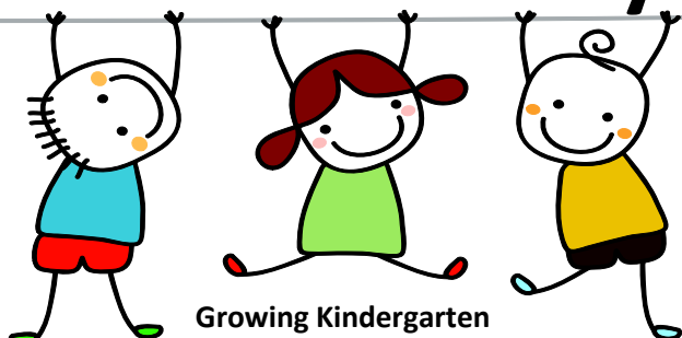
Growing Kindergarten Full-Day Kindergarten Conference

Full-day kindergarten is an important element of our state's strategy for improving student outcomes and closing the achievement gap. This year Growing K is offering three days of content especially for kindergarten! Participants may attend one, two or all three days, choosing from a variety of sessions. Sessions will include the Washington State Full-day Kindergarten modules (Child Development, Environments & Centers), WaKIDS 201, Plan Do Review with High Scope, developing language-rich environments, hands-on STEM and more!